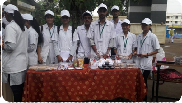
Food Stall arranged by hands on Training students of B.Tech Food Technology on 15/08/2017