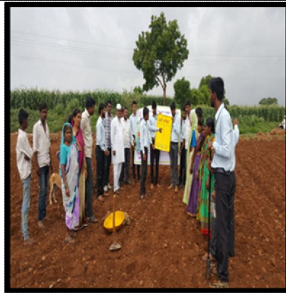
Demonstration on Soil Sampling at Shenit, Tal. Igatpuri on 08/07/2017