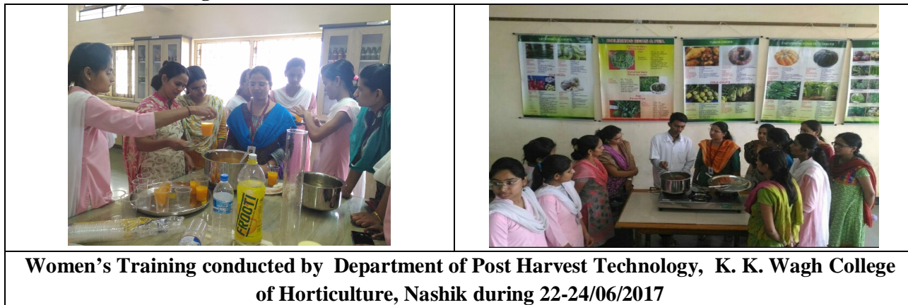
Women's Training conducted by Department of Post Harvest Technology, K. K. Wagh College of Horticulture, Nashik during 22-24/06/2017