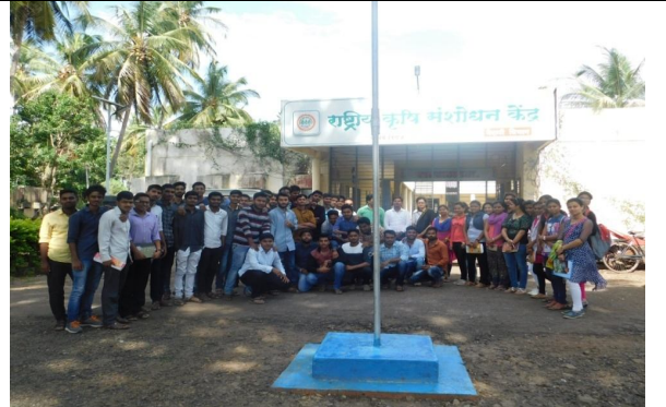
Educational visit of T.Y. B. Tech Agril. Engg. students to ARS, Kasabe Digraj, Dist.-Satara on 22/08/2017