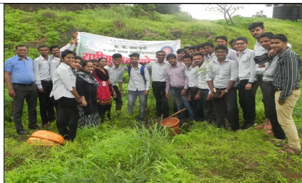
Tree plantation programme conducted by K.K.Wagh college of Agril. Engg., and Technology at Makhmalabad Farm on 10/07/2017