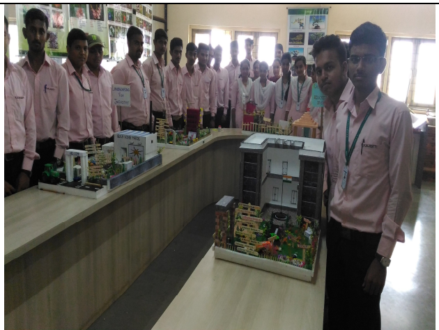
Landscape Models made by S. Y. Horticulture Students, Dept. of Floriculture and Landscaping, K. K. Wagh, College of Horticulture, Nashik on August, 2017