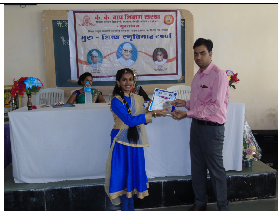
Guru- Shishya Smrutimaha Spardha- 2017