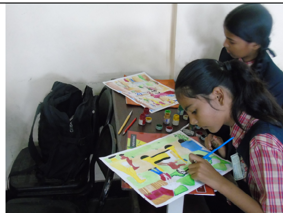
Guru- Shishya Smrutimaha Spardha- 2017