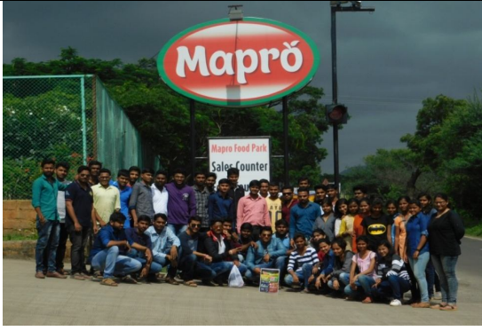
Educational visit of T.Y. B. Tech Agril. Engg. students to Mapro company, Wai, Dist.-Satara on 22/08/2017