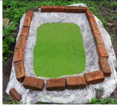
Demonstration on Azolla preparation at Aagaskhind, Tal-Igatpuri on 05/08/2017