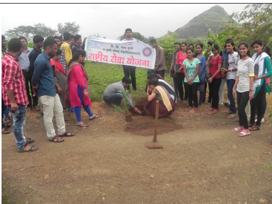
Tree plantation programme conducted by K.K.Wagh college of Agril. Engg., and Technology at Vilholi Farm on 12/07/2017