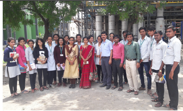
Educational visit of B. Tech. Food Tech. students to Grainnotech Pvt. Ltd., Aurangabad on 11/07/2017