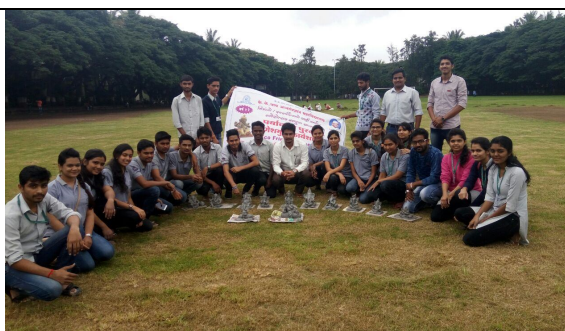
Tree plantation programme conducted at Makhamalabad Farm by B.Sc. Agri. students on 10/07/2017