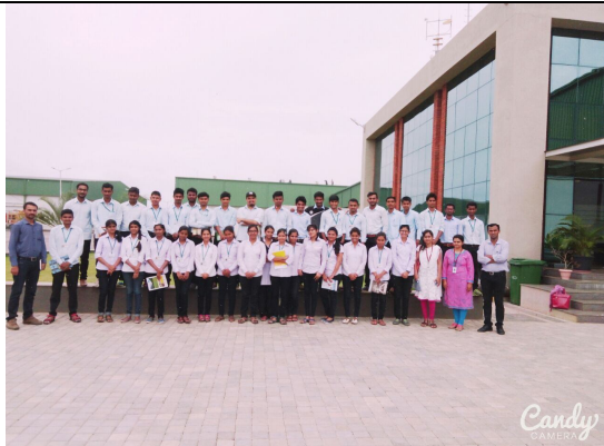
Educational visit of Biotechnology students to Sahyadri Farm, Nashik on 27/06/2017