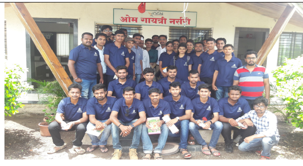
Educational visit of Final year B. Sc. Horticulture student to Om Gayatri Nursery Pimpas, Dist.-Nashik on 23/06/2017