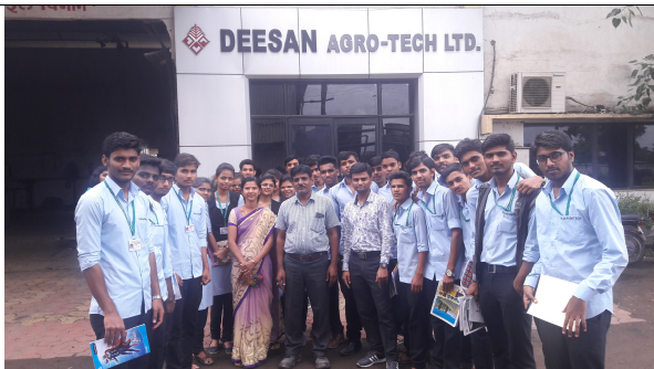
Educational visit of B. Tech. Food Tech. students to Deesan Agro Biotech. Ltd, Dhule on 18/07/2017