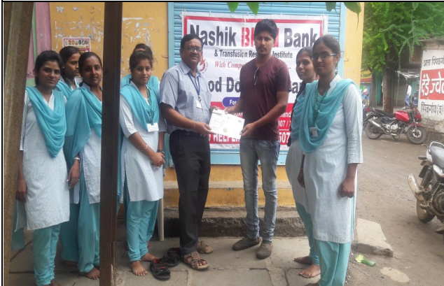
Blood donation camp at Davachwadi, Tal. Niphad on 20/07/2017 Total blood Bags collected:- 60